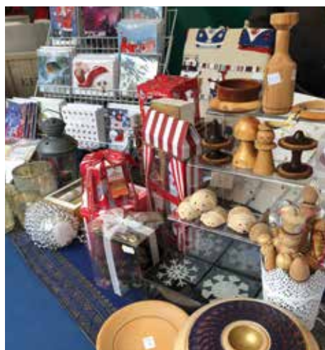
Photos L- R: Sanctuary Garden, Lynda Heywood, Jeff’s woodturning objects